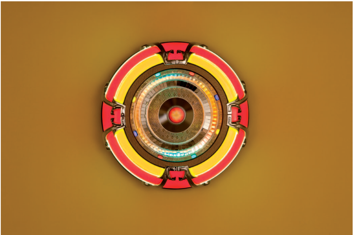
Kimsooja, Mandala: Zone of Zero, 2004-2010, Jukebox (Three Chants mixed with Tibetan, Gregorian and Islamic), 9:50 loop