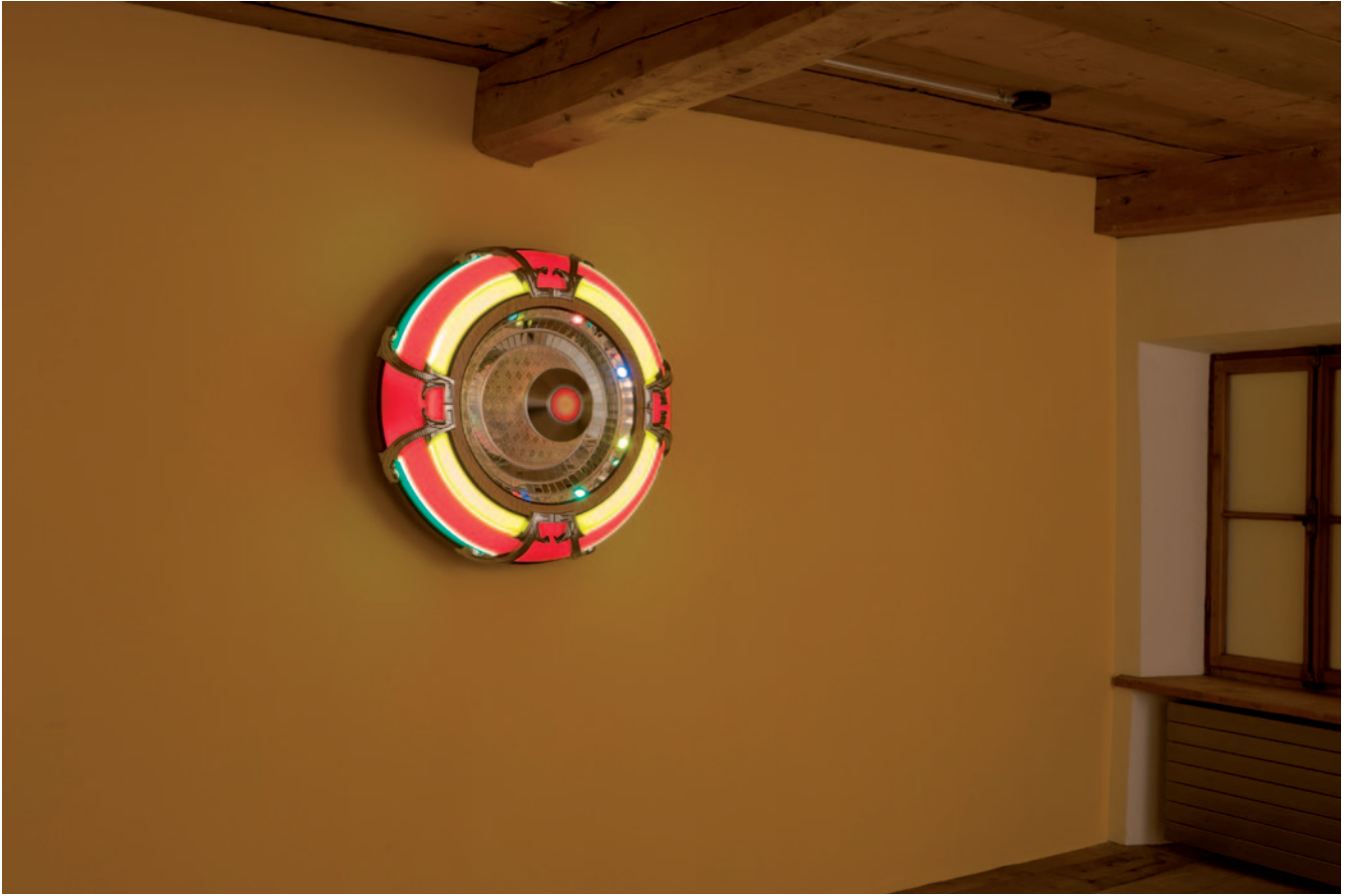
Kimsooja, Mandala: Zone of Zero, 2004-2010, Jukebox (Three Chants mixed with Tibetan, Gregorian and Islamic), 9:50 loop