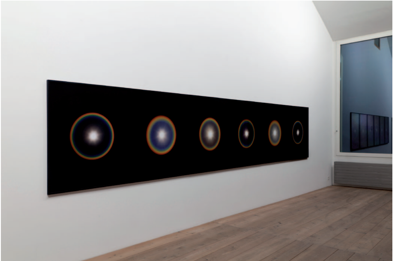
Kimsooja, The Sun - Unfolded, 2008 Serie of 6 Prints, Giclée (Inkjet) Print on Epson Paper, 116.5 cm x 99 cm each