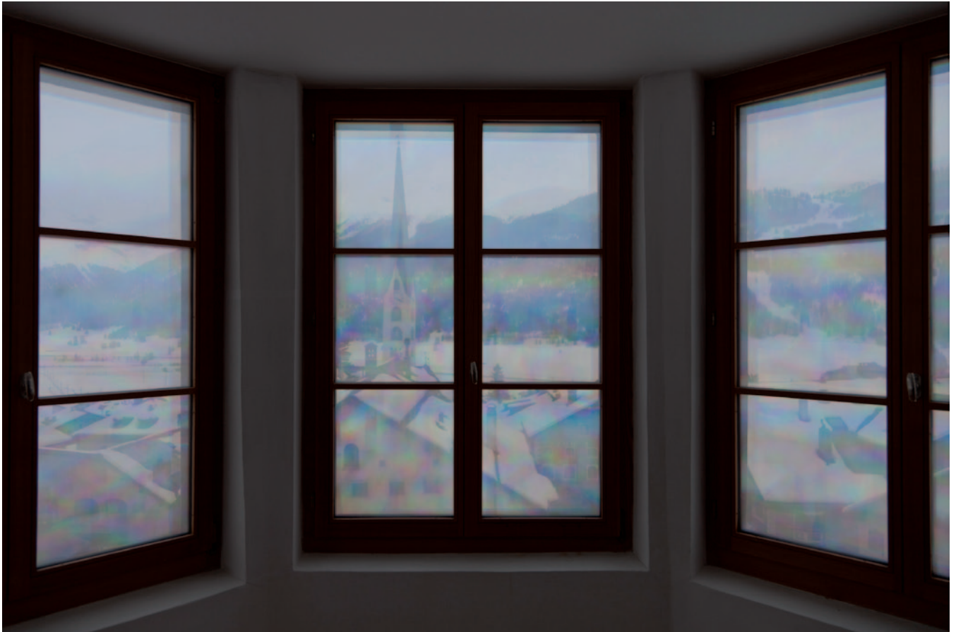
Kimsooja, To Breathe: Zuoz, 2010 Diffraction Grating Film on Window